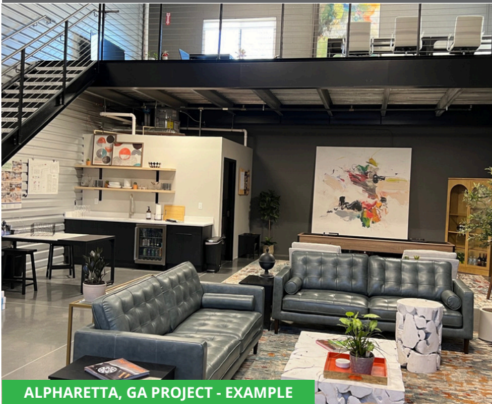
ALPHARETTA, GA PROJECT - EXAMPLE