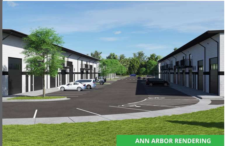
ANN ARBOR RENDERING